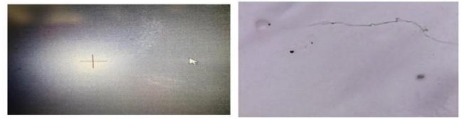
Figure 8: Images of PLA viewed under the metallurgical and USB microscopes on the left and right sides respectively

PLA will have a moderate concentration gradient of atoms due to the absence of visible grains and grain boundaries, as shown in Figure 8. This shows that the material has not formed any grains yet and the atoms are fairly dispersed in the material. As such, the atomic concentration gradient will not be high, meaning diffusion can take place through it.