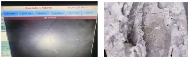
Figure 6: Images of fossil limestone viewed under the metallurgical and USB microscopes on the left and right sides respectively

Through observations, the fossil limestone looked like it had a leaf-like microstructure and is a sedimentary rock, as seen in figure 6. Therefore, it will have a more positive flux due to a lower atomic concentration gradient. Porous PDMS, as the name suggests, will have a positive flux, meaning more materials will diffuse through it due to its porous nature. The coated PDMS will have a highly negative flux due to the formation of solid grains and grain boundaries, as seen in figure 7. This shows that the coated PDMS has a high atomic concentration gradient, and as such will have a more negative flux.