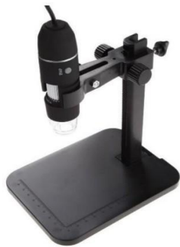
Figure 1: A picture of the USB microscope

The sample stage was cleaned to remove dust and foreign materials that would interfere with a clean viewing of the specimen. The USB microscope as seen in Figure 1 was connected to a laptop, and the camera application was opened and reversed to view the sample. The microscope was adjusted until the best focus was obtained using the micrometer calibration ruler. The images were captured using the camera application and saved. The images were later studied and analyzed for grain formations, and any further microstructural analysis. The images studied include all the ores and specimen mentioned in section IV "Ores used".