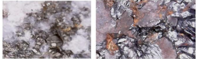
Figure 3: USB microscopic shot of the pyrite and magnetite ores on the left and right sides respectively.

Generally, the USB microscope gave a clearer structural make up, showing the colors of each ore, but didn't reveal the crystallography and grain boundaries in the various ores. However, the grains were irregularly shaped. The Cassiterite, Sphalerite, Pyrite and Magnetite ores were easy to image under the microscope as seen in figure 3 and Figure 4. This is as a result of the visibility of the grain boundaries in the ores. The Sphalerite's porosity was revealed through the USB microscope.