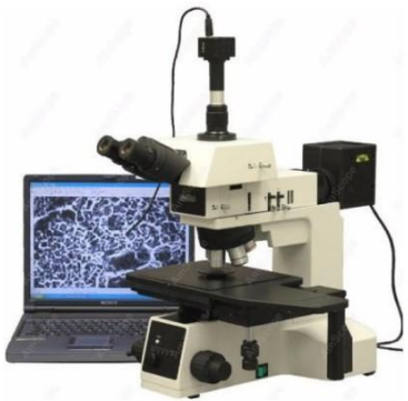
Figure 2: A picture of the metallurgical microscope set up

Place the sample on the sample stage and turn the head to focus the illuminator on the specimen. Turn the focus control till a clear image is observed on the screen. Take a picture of the image for further analysis. The procedure can be seen in figure 2 below.